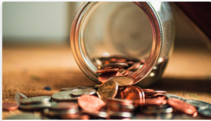
Loose Coins and Singles

Food is essential to life every day all over the world. World Central Kitchen is the first to respond with fresh prepared chef made meals where ever the crisis is and whatever the crisis. In 2010 Chef Jose Andres headed to Haiti after a devastating earthquake. That was his first to prepare meals for those during a natural disaster. Since preparing the first few times in countries experiencing emer-