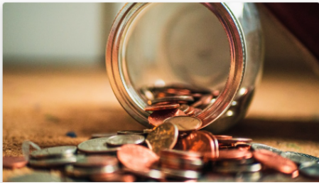
Loose Coins and Singles

Your gifts to Glenview United Methodist are a testimony to your faith and the confidence you have in GUMC. Both lifetime gifts and testa- mentary (given through your will) gifts ex- press your feelings in a meaningful way.