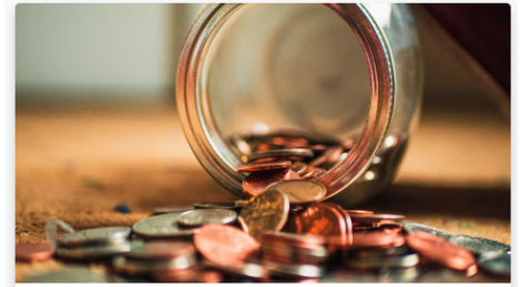
Loose Coins and Singles

With locations in Edgewater and Rogers Park, CARE FOR REAL provides many services. They provide food, clothing, referral services, and additional help. With community support they have welcomed more than 2,500 visits to the food pantry a month. Also, the program provides ready-to-eat items for the unhoused, people without kitchens, and those living in transitional housing. Care for Real serves with compassion to improve the health and wellbeing of low income to foster a healthier, equitable and more stable community.