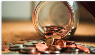
Loose Coins and Singles

Donations can also be made though the GUMC website. Go to www.glenviewumc.org and click on "Donate Online" and use a checking, savings or credit card.